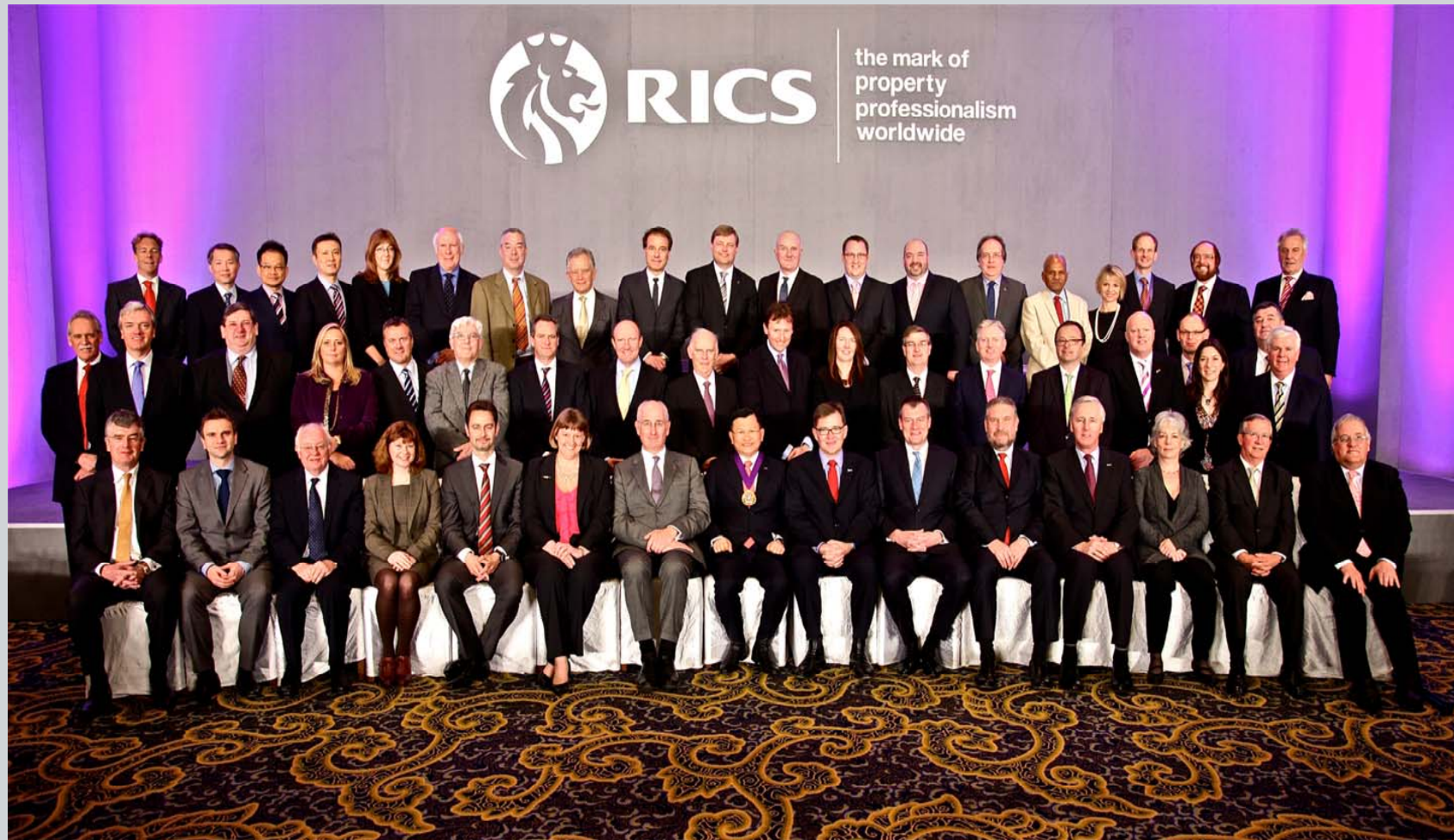
Governing Council 2011/12